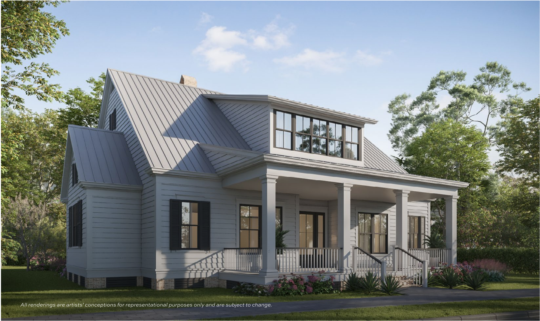
All renderings are artists’ conceptions for representational purposes only and are subject to change.

This breathtaking Lowcountry cottage is surrounded by tall oaks, providing ample privacy within the folds of nature’s tranquility. The expansive front and back porch space provides every opportunity to take in views of nature. On the main floor, the primary suite includes a large walk-in closet with an ensuite bath, while the second floor offers two additional bedrooms, plus a loft area.