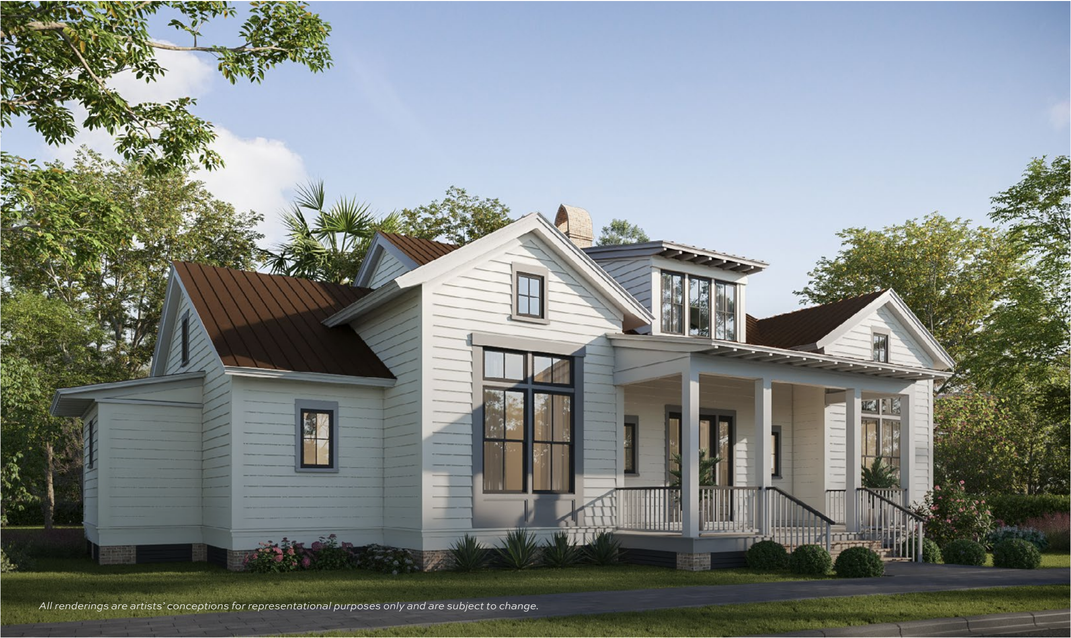
All renderings are artists’ conceptions for representational purposes only and are subject to change.

Set on an expansive 0.52-acres, this corner property is an idyllic setting to build a dream estate. With ample room for yearlong indoor-outdoor living, this single-story Lowcountry cottage is surrounded by towering oaks and a community park just a stone’s throw away. A screened-in back porch makes this home design complete, along with tall ceilings, a gourmet kitchen and a grilling porch.