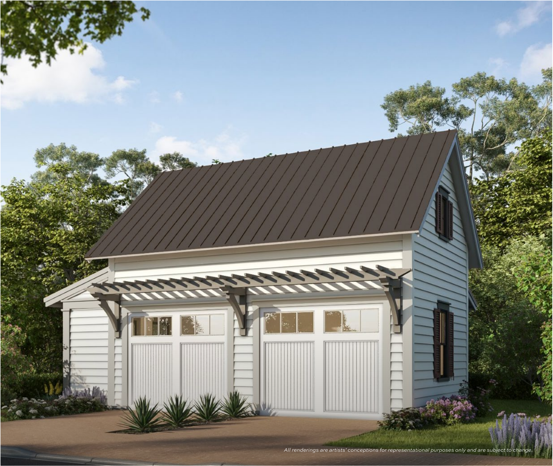
All renderings are artists' conceptions for representational purposes only and are subject to change.

Two-car garage featuring a workshop and an upstairs attic.