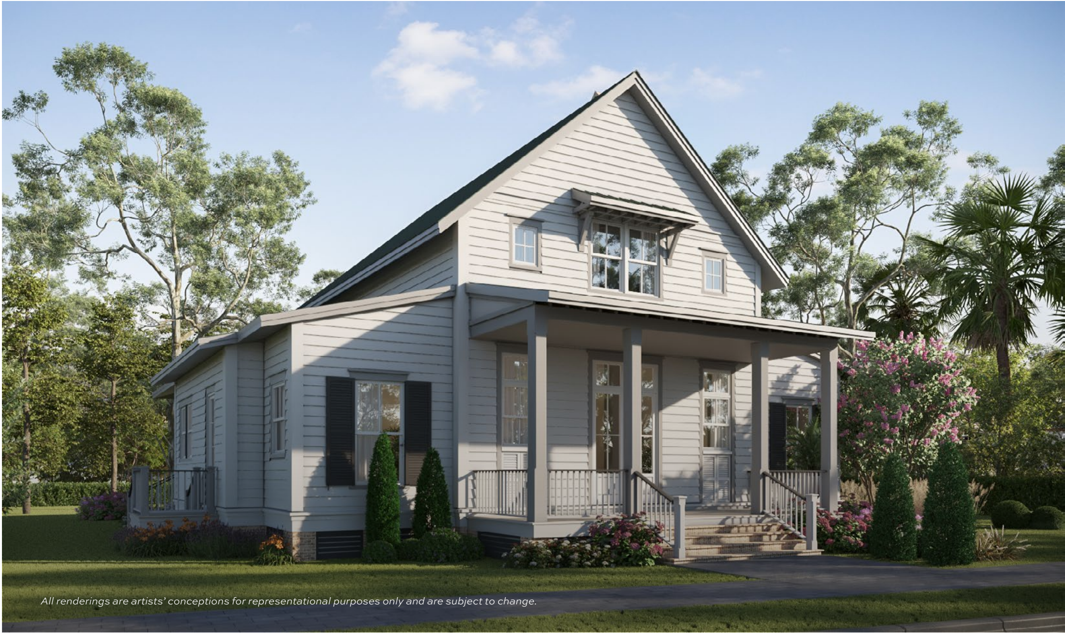
All renderings are artists' conceptions for representational purposes only and are subject to change.

Featuring expansive front and back porches, this stunning single-story Lowcountry cottage home design is ideal for indoor-outdoor living all year long. Surrounded by whispering oak trees, this 0.39-acre property offers an abundance of privacy and space to unwind completely.