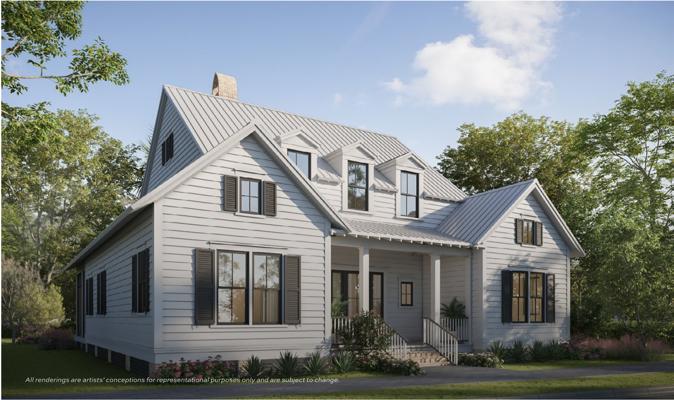
All renderings are artists' conceptions for representational purposes only and are subject to change.

This two-story Southern cottage home design features a primary suite on the main level with walk-in closets, an ensuite bath with double vanities, separate shower, and a freestanding tub. Both front and back porches make for a luxurious indoor-outdoor feel.