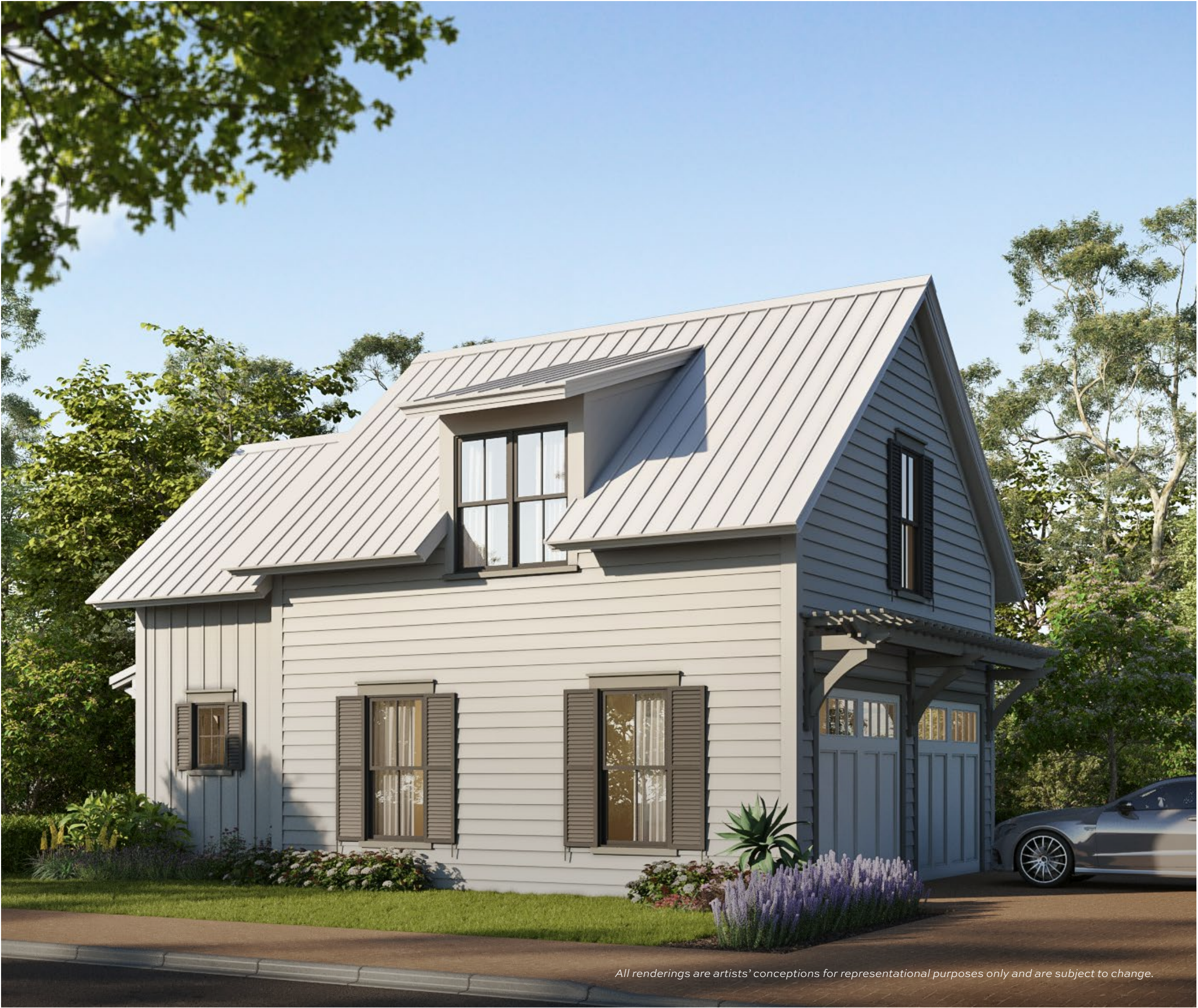
All renderings are artists' conceptions for representational purposes only and are subject to change.

Two-car garage featuring a one-bedroom upstairs studio with a kitchenette.