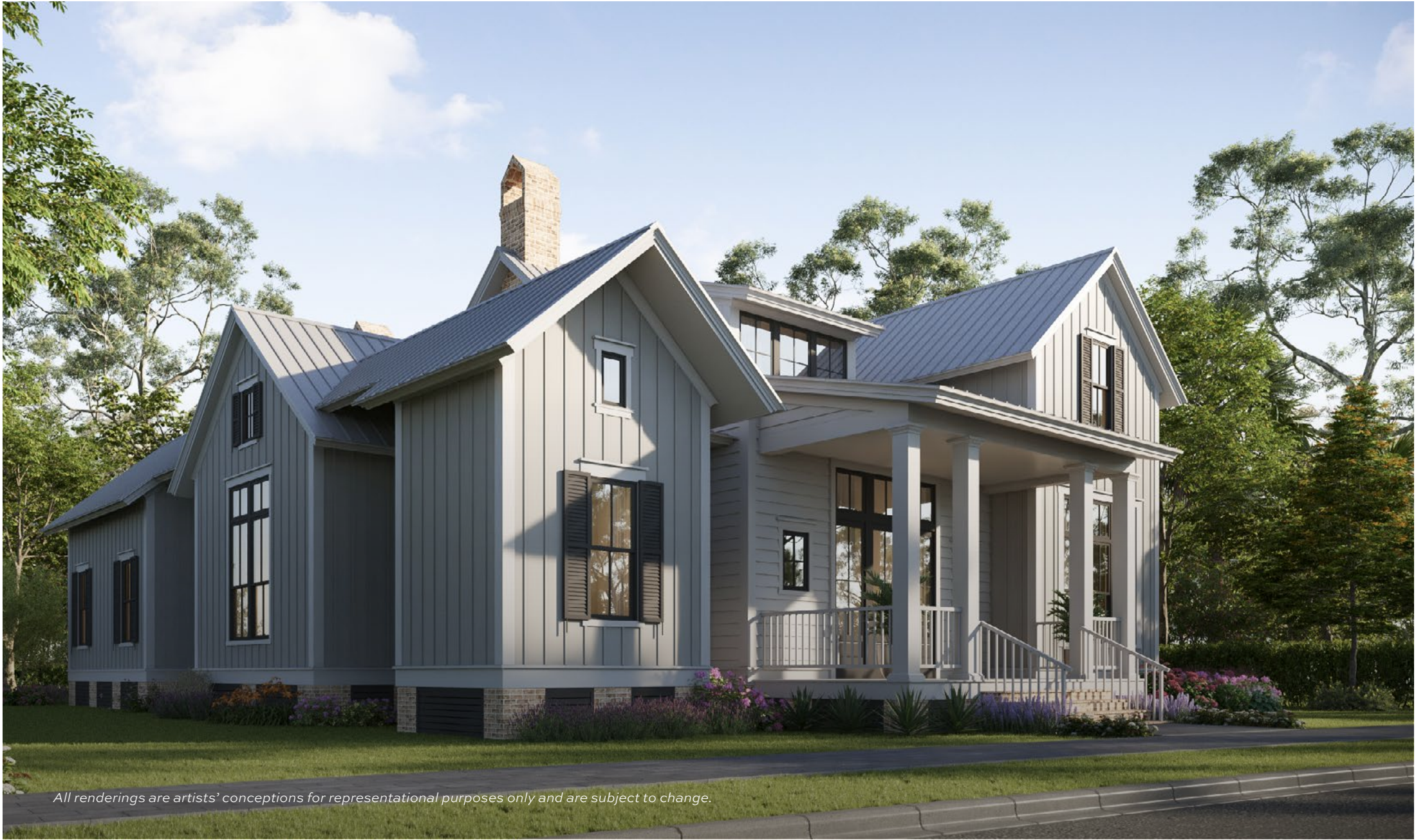
All renderings are artists' conceptions for representational purposes only and are subject to change.

Encircled by great oaks, this charming home design features an expansive porch space ideal for summer evenings relaxing with family. Enveloped in peaceful privacy, this spacious two-level estate is nothing short of a dream.