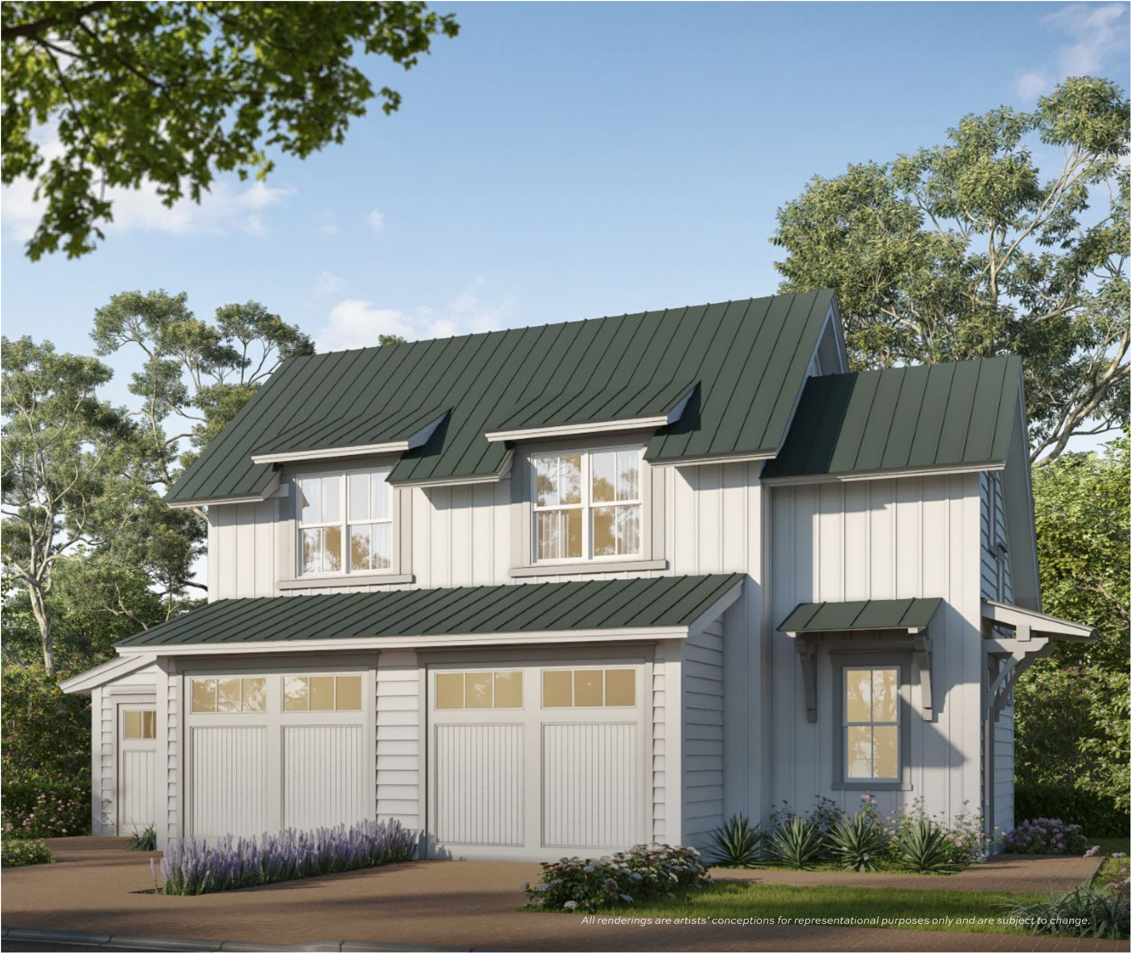
All renderings are artists' conceptions for representational purposes only and are subject to change.

Two-car garage with an attached golf cart shed and 467 SF of space for a full master suite with kitchenette, or bonus room.